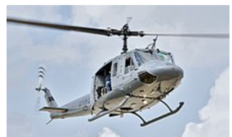
A USAF TH-1H out of Randolph Air Force Base, 2005