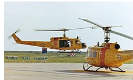
Base Rescue Moose Jaw CH-118 Iroquois helicopters at CFB Moose Jaw, 1982

Note: In U.S. service the G, J, Q, R, S, T, W and Z model designations are used by the AH-1 . The UH-1 and AH-1 are considered members of the same H-1 series. The military does not use I (India) or O (Oscar) for aircraft designations to avoid confusion with "one" and "zero" respectively.