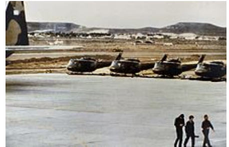
UH-1Hs at Port Stanley Airport. These were transported to the islands by C-130H Hercules and did not have their rotors reattached yet

Nine Argentine Army Aviation UH-1Hs and two Argentine Air Force Bell 212 were included with the aircraft deployed during the Falklands War . They performed general transport and SAR missions and were based at Port Stanley (BAM Puerto Argentino). Two of the Hueys were destroyed and, after the hostilities had ended, the balance were captured by the British. [42] Three captured aircraft survive as museum pieces in England and Falklands.