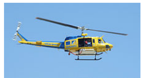
Ventura County Sheriff's Department Air Unit Fire Support Bell HH-1H

While earlier "short-body" Hueys were a success, the Army wanted a version that could carry more troops. Bell's solution was to stretch the HU-1B fuselage by 41 in (104 cm) and use the extra space to fit four seats next to the transmission, facing out. Seating capacity increased to 15, including crew. [9] The enlarged cabin could also accommodate six stretchers and a medic, two more than the earlier models. [9] In place of the earlier model's sliding side doors with a single window, larger doors were fitted which had two windows, plus a small hinged panel with an optional window, providing enhanced access to the cabin. The doors and hinged panels were quickly removable, allowing the Huey to be flown in a "doors off" configuration.