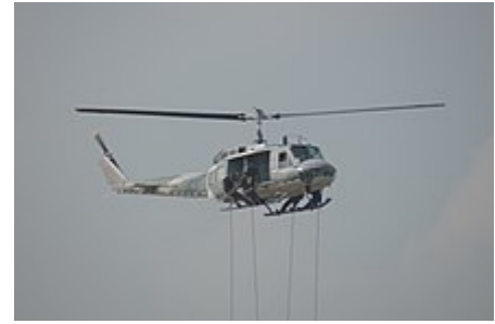
Royal Thai Air Force special operation troops rappel from UH-1 during a demonstration on Children day 2013