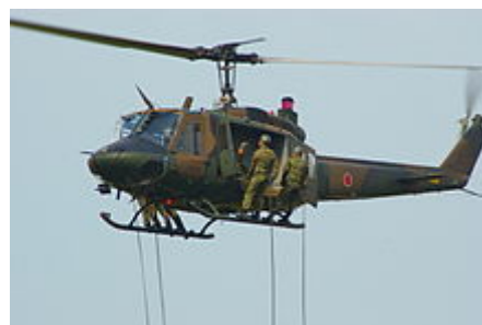
JGSDF UH-1J in Okadama STA, 2007