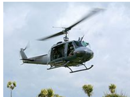
A Royal New Zealand Air Force No. 3 Squadron UH-1H Iroquois, November 2009

The Royal New Zealand Air Force had an active fleet of 13 Iroquois serving with No. 3 Squadron RNZAF . [58] The first delivery was five UH-1D in 1966 followed in 1970 by nine UH-1H and one more UH-1H in 1976. All of the UH-1D aircraft were upgraded to 1H specification during the 1970s. Two ex-U.S. Army UH-1H attrition airframes were purchased in 1996, one of which is currently in service. Three aircraft have been lost in accidents. [59]