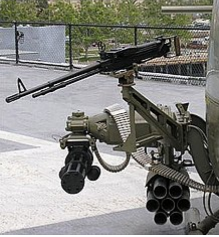
Typical armament for UH-1 gunship

The UH-1H's dual controls are conventional for a helicopter and consist of a single hydraulic system boosting the cyclic stick, collective lever and anti-torque pedals. The collective levers have integral throttles, although these are not used to control rotor rpm, which is automatically governed, but are used for starting and shutting down the engine. The cyclic and collective control the main rotor pitch through push-pull tube linkages to the swashplate, while the anti-torque pedals change the pitch of the tail rotor via a tensioned cable arrangement. Some UH-1Hs have been modified to replace the tail rotor control cables with push-pull tubes similar to the UH-1N Twin Huey . [18]