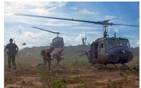
UH-1Ds airlift members of the 2nd Battalion, 14th Infantry Regiment from the Filhol Rubber Plantation area to a staging area in 1966.

The HU-1A (later redesignated UH-1A) first entered service with the 101st Airborne Division at Fort Campbell, Kentucky, the 82nd Airborne Division , and the 57th Medical Detachment. Although intended for evaluation only, the Army quickly pressed the new helicopter into operational service, and Hueys with the 57th Medical Detachment arrived in Vietnam in March 1962. [13] The UH-1 has long been a symbol of US involvement in Southeast Asia in general and Vietnam in particular, and as a result of that conflict, has become one of the world's most recognized helicopters. In Vietnam primary missions included general support, air assault , cargo transport, aeromedical evacuation , search and rescue , electronic warfare, and later, ground attack. During the conflict, the craft was upgraded, notably to a larger version based on the Model 205. This version was initially designated the UH-1D and flew operationally from 1963.