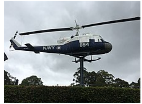
An RAN UH-1B pole-mounted at Nowra

UH-1s were operated by El Salvador Air Force, being at its time the biggest and most experienced combat helicopter force in Central and South America, fighting during 10 years and being trained by US Army in tactics developed during the Vietnam War. UH-1M and UH-1H helicopters used by El Salvador were modified to carry bombs instead of rocket pods. [48]