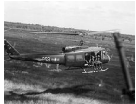
Republic of Vietnam Air Force (VNAF) UH-1H lands during a combat mission in Southeast Asia in 1970

In October 1965, the United States Air Force (USAF) 20th Helicopter Squadron was formed at Tan Son Nhut Air Base in South Vietnam, equipped initially with CH-3C helicopters. By June 1967 the UH-1F and UH-1P were also added to the unit's inventory, and by the end of the year the entire unit had shifted from Tan Son Nhut to Nakhon Phanom Royal Thai Air Force Base , with the CH-3s transferring to the 21st Helicopter Squadron . On 1 August 1968, the unit was redesignated the 20th Special Operations Squadron . The 20th SOS's UH-1s were known as the Green Hornets , stemming from their color, a primarily green two-tone camouflage (green and tan) was carried, and radio call-sign "Hornet". The main role of these helicopters were to insert and extract reconnaissance teams, provide cover for such operations, conduct psychological warfare, and other support roles for covert operations especially in Laos and Cambodia during the so-called Secret War . [32]