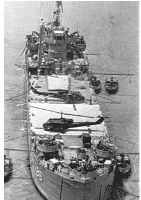
Two UH-1B Huey gunships from HAL-3 "Seawolf" sit on the deck of USS Garrett County in Mekong Delta, South Vietnam.

During the course of the war, the UH-1 went through several upgrades. The UH-1A, B, and C models (short fuselage, Bell 204) and the UH-1D and H models (stretched-fuselage, Bell 205) each had improved performance and load-carrying capabilities. The UH-1B and C performed the gunship, and some of the transport, duties in the early years of the Vietnam War. UH-1B/C gunships were replaced by the new AH-1 Cobra attack helicopter from 1967 to late 1968. The increasing intensity and sophistication of NVA anti-aircraft defenses made continued use of UH-1 gunships impractical, and after Vietnam the Cobra was adopted as the Army's main attack helicopter. Devotees of the UH-1 in the gunship role cite its ability to act as an impromptu Dustoff if the need arose, as well as the superior observational capabilities of the larger Huey cockpit, which allowed return fire from door gunners to the rear and sides of the aircraft. [8][13] In air cavalry troops (i.e., companies ) UH-1s were combined with infantry scouts , OH-6 and OH-58 aero-scout helicopters, and AH-1 attack helicopters to form several color-coded teams (viz., blue, white, red, purple, and pink) to perform various reconnaissance , security, and " economy of force " missions in fulfilling the traditional cavalry battlefield role.