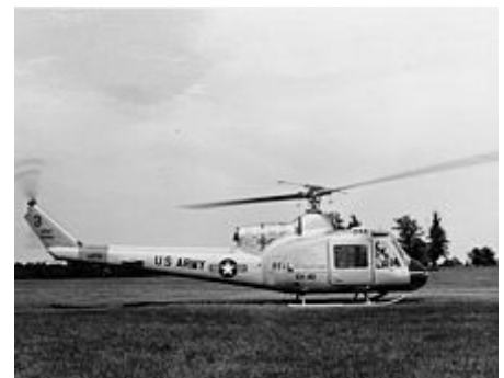
A Bell XH-40, a prototype of the UH-1

In 1952, the U.S. Army identified a requirement for a new helicopter to serve as medical evacuation (MEDEVAC), instrument trainer, and general utility aircraft. The Army determined that current helicopters were too large, underpowered, or too complex to maintain easily. In November 1953, revised military requirements were submitted to the Department of the Army. [3] Twenty companies submitted designs in their bid for the contract, including Bell Helicopter with the Model 204 and Kaman Aircraft with a turbine-powered version of the H-43 . On 23 February 1955, the Army announced its decision, selecting Bell to build three copies of the Model 204 for evaluation with the designation XH-40. [4]