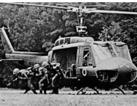
A rifle squad from the 1st Squadron, 9th Cavalry exiting from a UH-1D.

During service in the Vietnam War, the UH-1 was used for various purposes and various terms for each task abounded. UH-1s tasked with ground attack or armed escort were outfitted with rocket launchers, grenade launchers, and machine guns. As early as 1962, UH-1s were modified locally by the companies themselves, who fabricated their own mounting systems. [19] These gunship UH-1s were commonly referred to as "Frogs" or "Hogs" if they carried rockets, and "Cobras" or simply "Guns" if they had guns. [20][21][N 4][22] UH-1s tasked and configured for troop transport were often called "Slicks" due to an absence of weapons pods. Slicks did have door gunners , but were generally employed in the troop transport and medevac roles. [8][13]