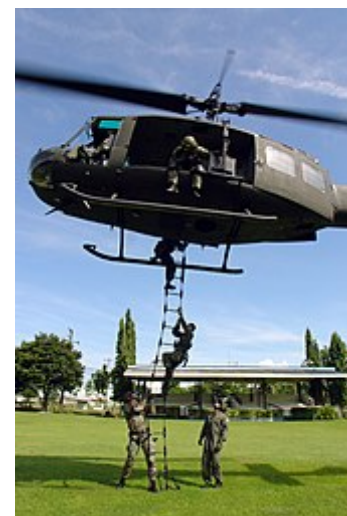
Philippine Air Force Airmen with the 6th SOS unit of the USAF during a bilateral exercise

Very late in the Rhodesian Bush War the Rhodesian Air Force obtained 11 former Israeli Agusta-Bell 205As, [65] known in service as Cheetahs . After much work these then formed No. 8 Sqn Rhodesian Air Force and took part as troop transports in the counter-insurgency fight. One was lost in combat in September 1979, when hit in Mozambique by a RPG. At least another three were lost. The survivors were put up for sale in 1990. [66]