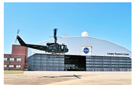
NASA's UH-1H returns to Langley after supporting space shuttle operations at Kennedy Space Center.