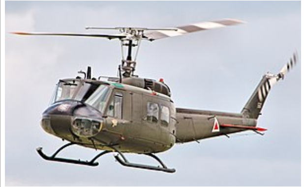
A Bell UH-1 Iroquois