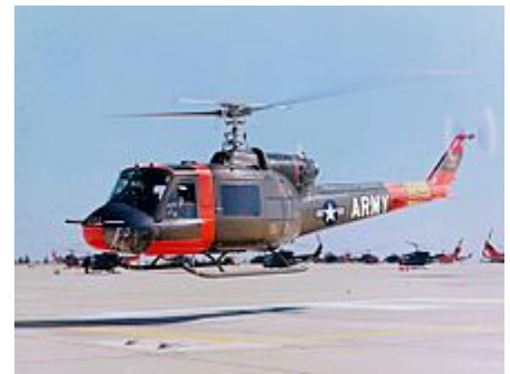
UH-1A Iroquois in flight