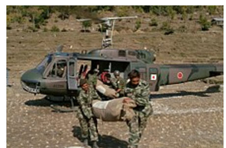
A JGSDF Bell-Fuji UH-1H conducting Kashmir earthquake relief activities (2005)

The aircraft are also used to conduct water bombing against fires. [55][56]