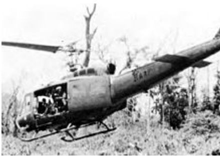
A 9 Sqn UH-1D in Vietnam, 1970

The Royal Australian Air Force employed the UH-1H until 1989. Iroquois helicopters of No. 9 Squadron RAAF were deployed to South Vietnam in mid 1966 in support of the 1st Australian Task Force . In this role they were armed with single M60 doorguns. In 1969 four of No. 9 Squadron's helicopters were converted to gunships (known as 'Bushrangers'), armed with two fixed forward firing M134 7.62 mm minigun (one each side) and a 7-round rocket pod on each side. Aircrew were armed with twin M60 flexible mounts in each door. UH-1